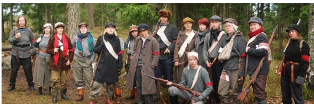
Kemi 1st Trousers Guard.